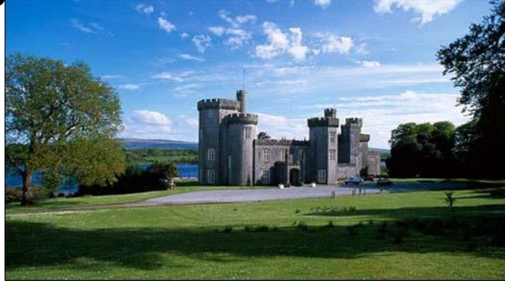
Lough Cutra Castle (~1817), Gort Hotel & Functions