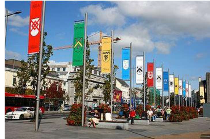
A display of the fourteen tribal flags in Eyre Square, Galway.