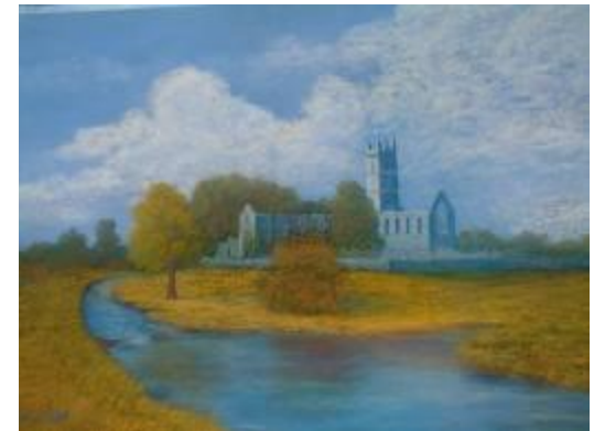
Clare River, Claregalway