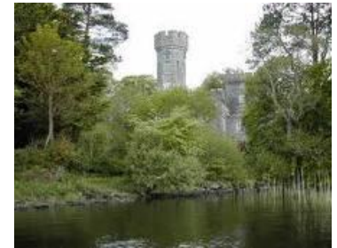
Lough Cutra Castle