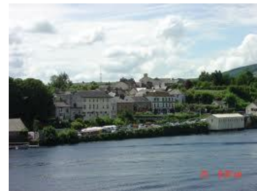
Lough Derg & Portumna