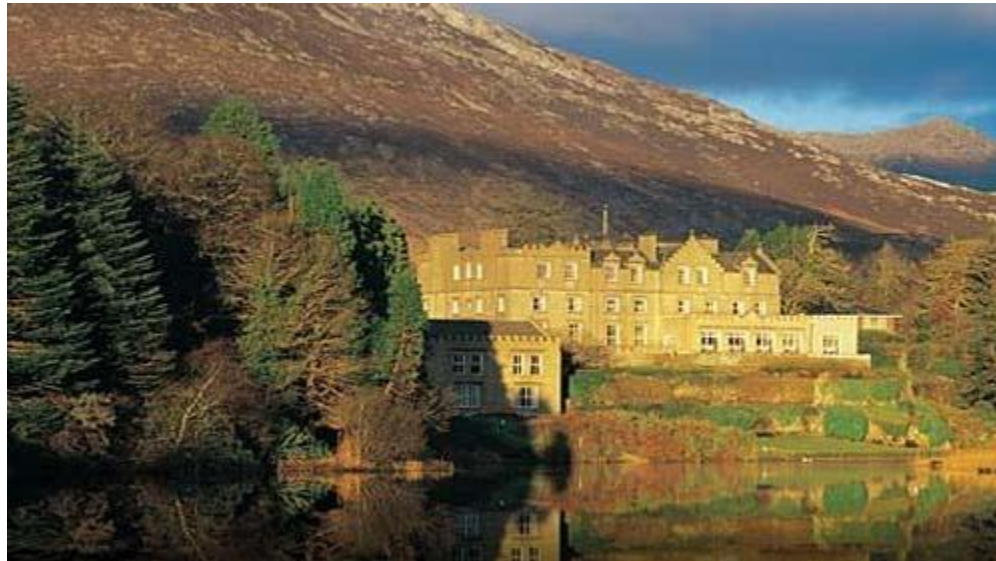
Ballynahinch Castle (~1756), Gort Hotel & Functions