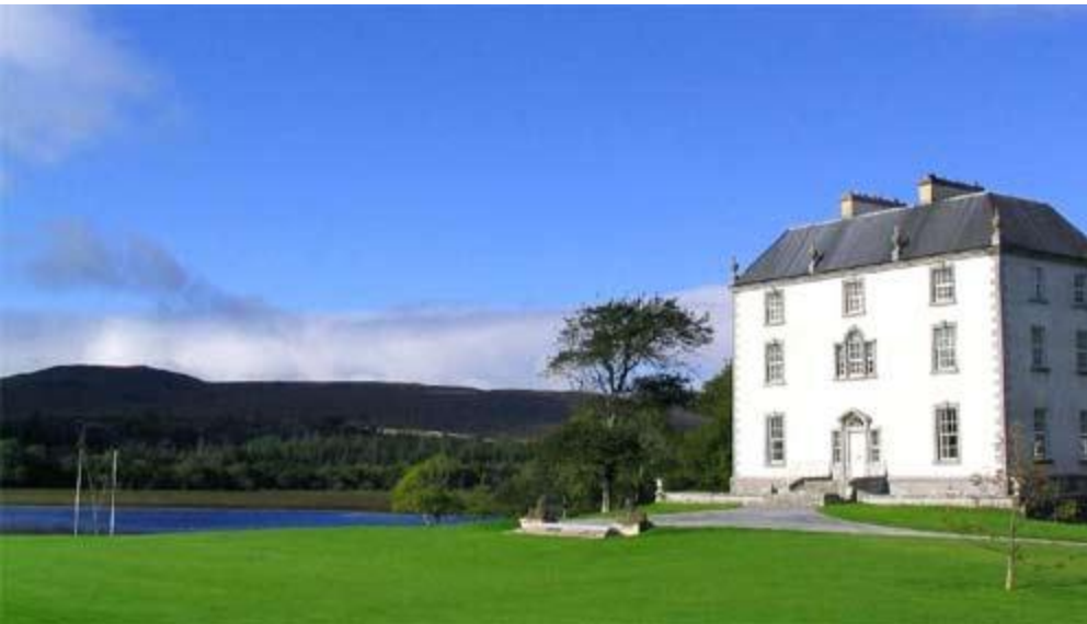
Ross Castle (1590), Oughterard