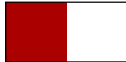
Maroon & White