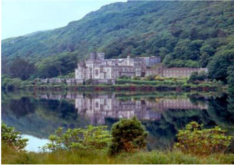
Abbeyglen Castle (1832), Clifden Hotel & Functions