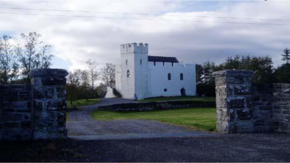
Carraigin Castle (~1300's), Headford